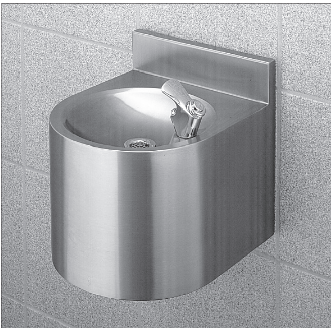
DWF02 - WITH SHROUD

Each drinking fountain is supplied with a flush grated waste fitting and a chrome plated shielded bubbler complete with a self closing push button valve.