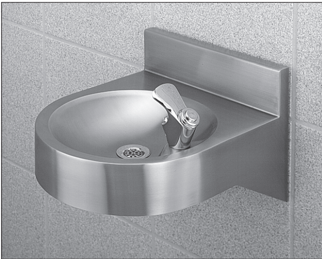
DWF01 - WITHOUT SHROUD